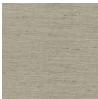
Maurice Kain INVENTA PEBBLE