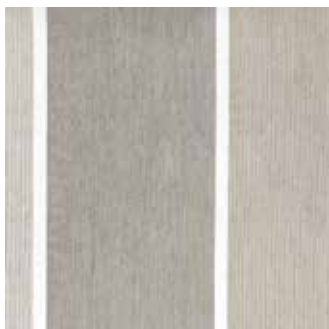
Maurice Kain ASTON QUARTZ

The Quebec design & colours, have been chosen by our design team to complement these Maurice Kain curtain fabrics: